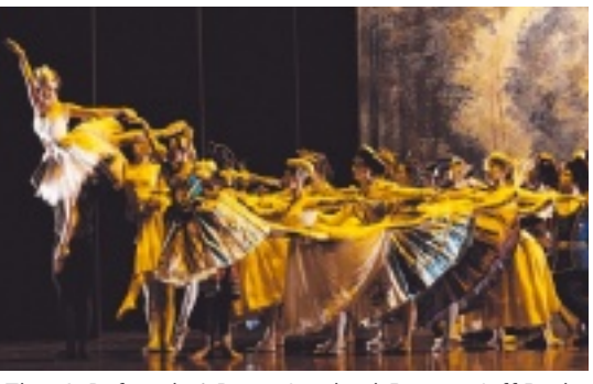
There's Definitely A Prince Involved