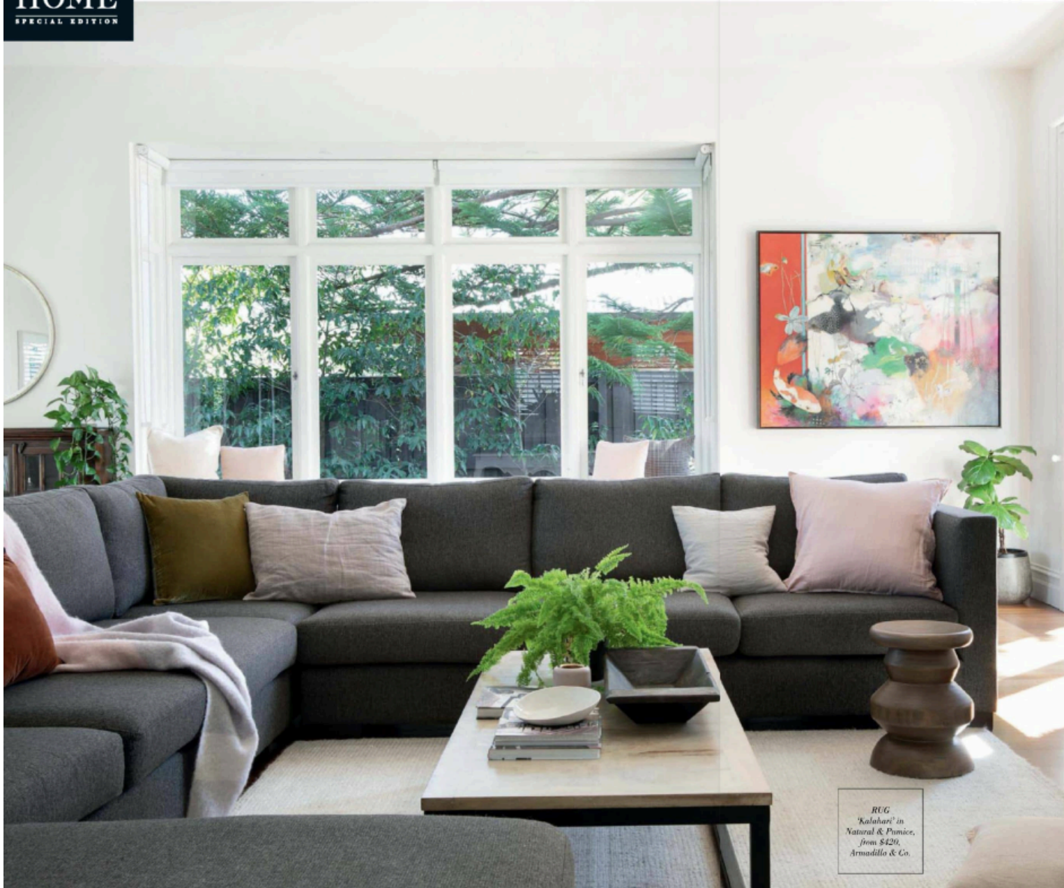
RUG 'Kalahari' in Natural & Pumice, from $420, Armadillo & Co.